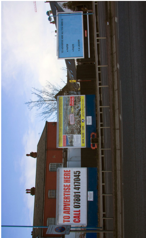
MBSTR, To advertise here all you need is: paper; paste; a ladder, 2012, London, United Kingdom