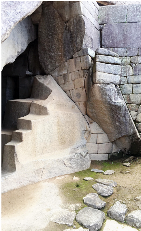
'Mother Earth Temple or Temple of the Dead', 2016, Machu Picchu, Peru