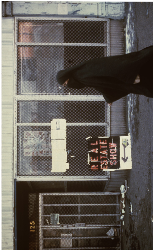
'In front of the infamous real estate show', New Year's Day 1980, Lower East Side, New York, United States