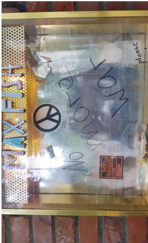
'Good Neighbours', 2018, Berlin Mitte, Germany