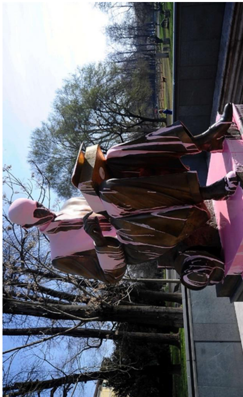
NUDM, Breaking it Down: Make the Power Visible, 2018, Milano, Italy