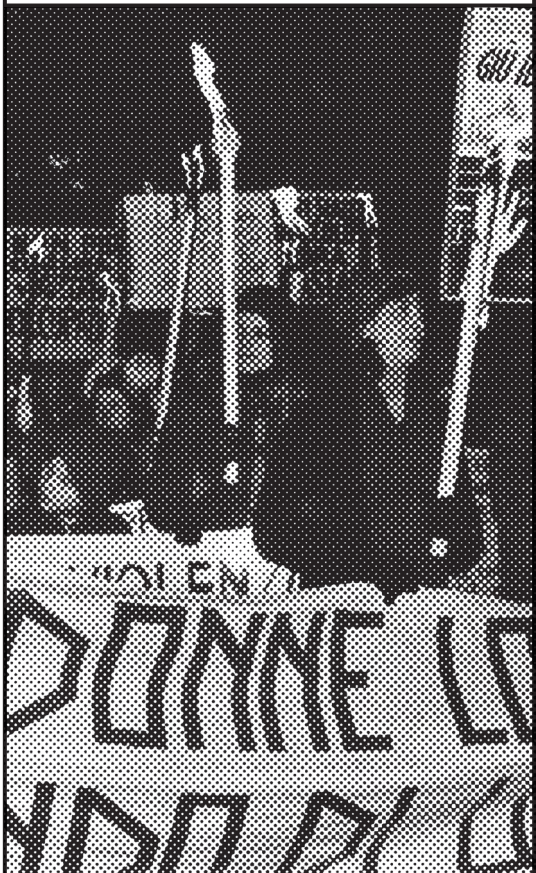
Torch-lit procession against violences on women by the collective Riprendiamoci la notte Rome (IT), 27.09.1976