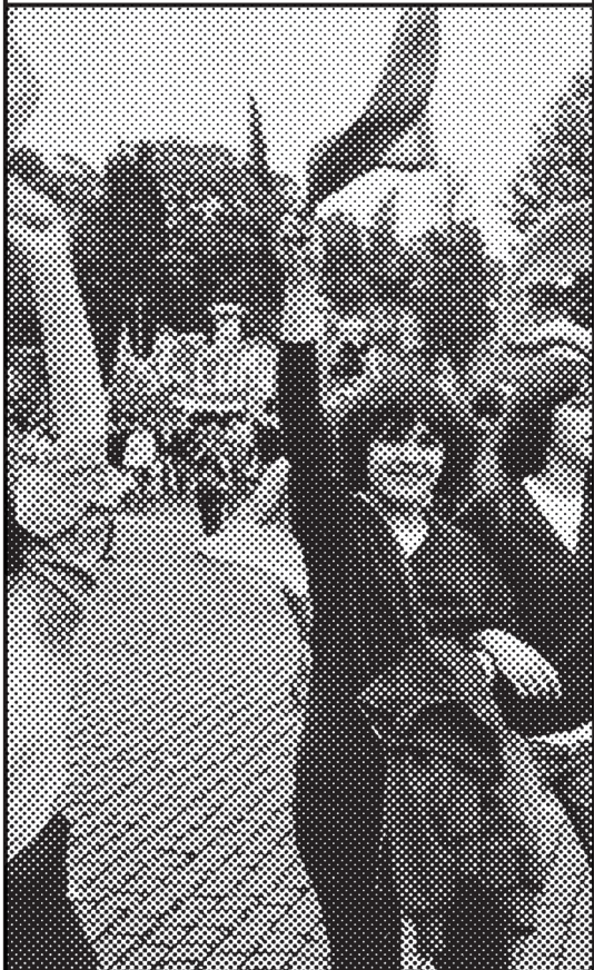
Women textile workers weaving fabrics for their rights Rome (IT), 26.05.1978