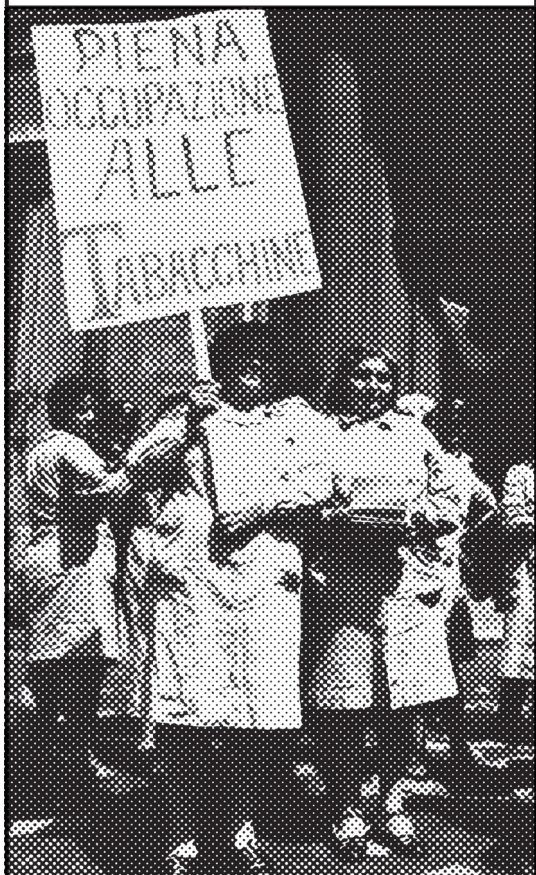
Le sciopero delle tabacchine: picket of the women in struggle Rome (IT), 1970