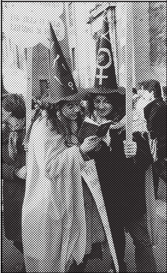
Women conjuring against the amendment that overturns the law on sexual violences Rome (IT), 05.01.1983