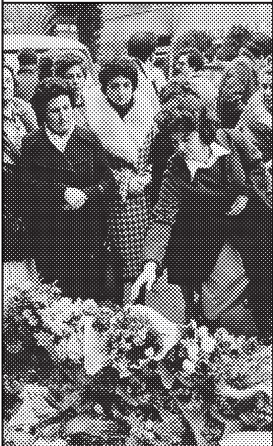
Women of the UDI (Unione Donne Italiane) laying flowers for the victims of Via Fani Rome (IT), 16.9.1979