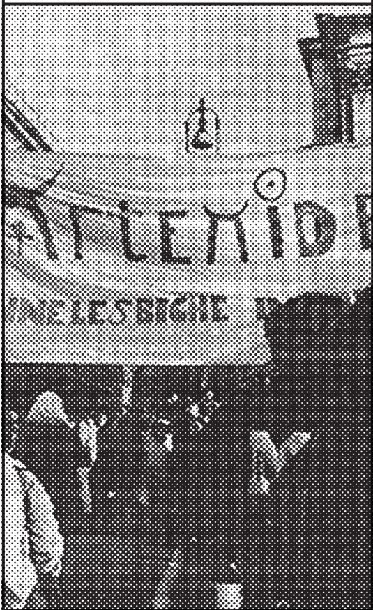
The group Artemide Donne Lesbiche in rivolta unfurls their banner in procession Rome (IT), 08.03.1979